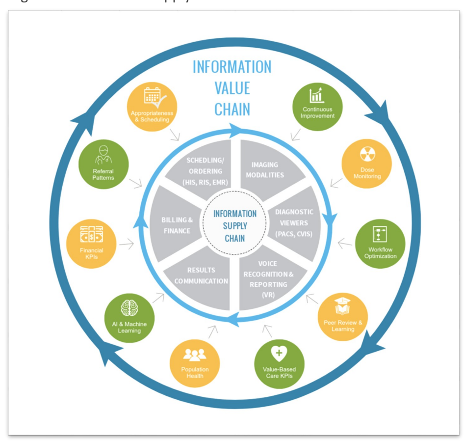
Figure 2: Information Supply and Value Chain